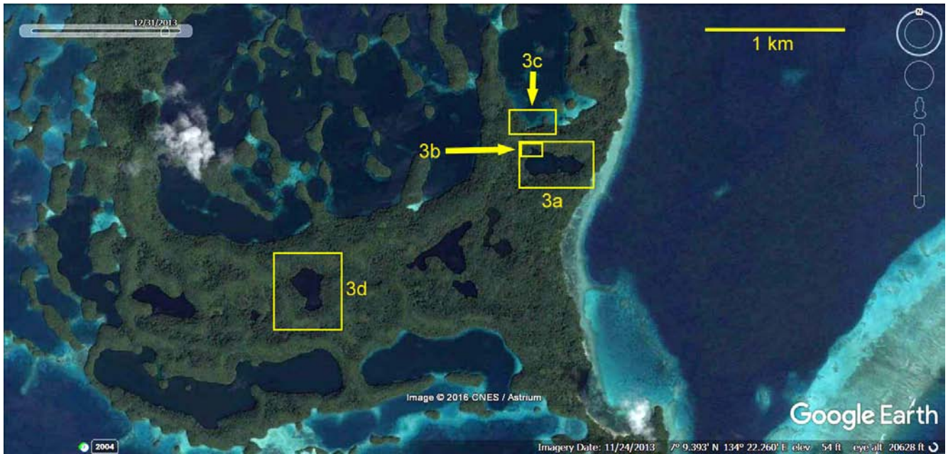
Figure 3. Mecherchar Island in the southern rock islands is ~20km distant from Koror and harbor two marine lakes that were sampled: Jellyfish Lake (3a) and Clear Lake (3d).