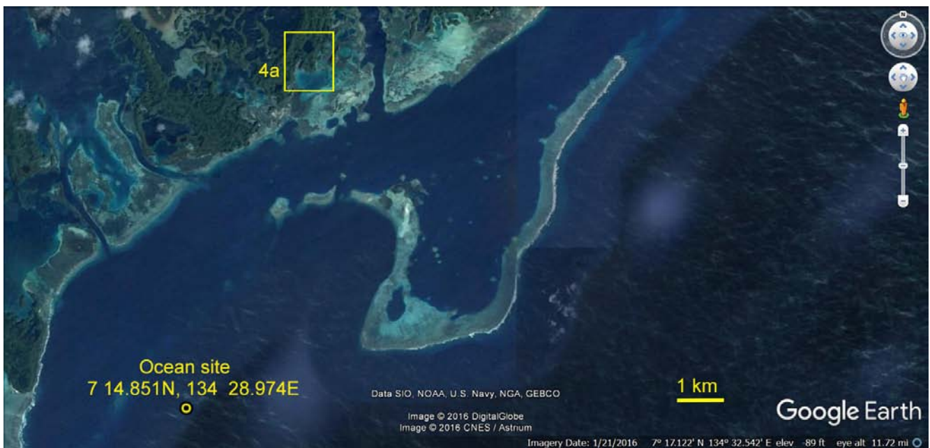
Figure 4. Northern part of Koror showing Ngermeuangel Lake, detailed in Figure 4a, and its proximity to the Ocean site where 4 comparative samples were collected, labeled OCEAN 01-04.