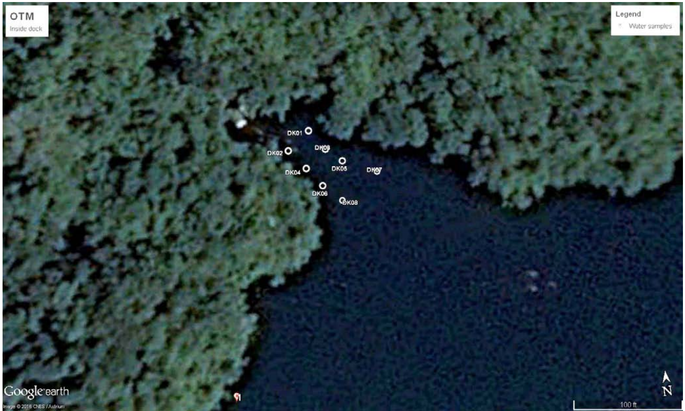
Figure 3b. Sampling sites for water inside of Jellyfish Lake near the tourist dock are labeled DK01-DK08.