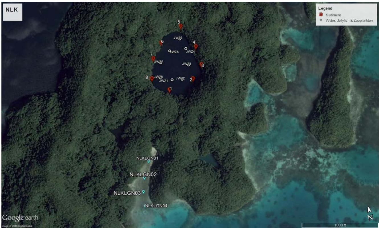
Figure 4a. Ngermeuangel Lake (above): JW indicates sites where medusae jellyfish and water samples were collected. Numbers 1-8 around the lake's perimeter are sediment sampling sites. NLKLG01-04 sites (below) are the 4 lagoon comparative sites taken outside of Ngermeuangel Lake.