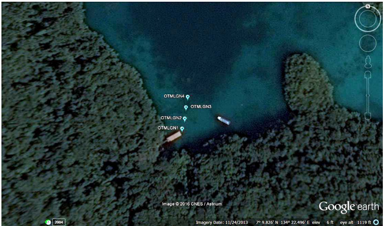
Figure 3c. Sampling sites for water in the lagoon outside of Jellyfish Lake, near the tourist dock are labeled OTMLGN 1-4.