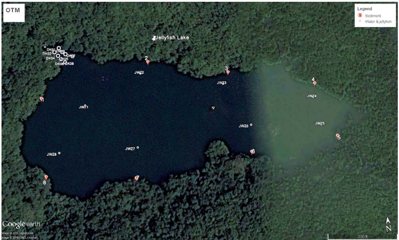
Figure 3a. Sampling sites inside of Jellyfish Lake on Mecherchar Island. JW indicates points that water and medusae jellyfish samples were collected; numbers 1-8 around the perimeter of the lake are sediment sampling locations. The concentrated points in the upper left of the photo are detailed in Figure 3b.