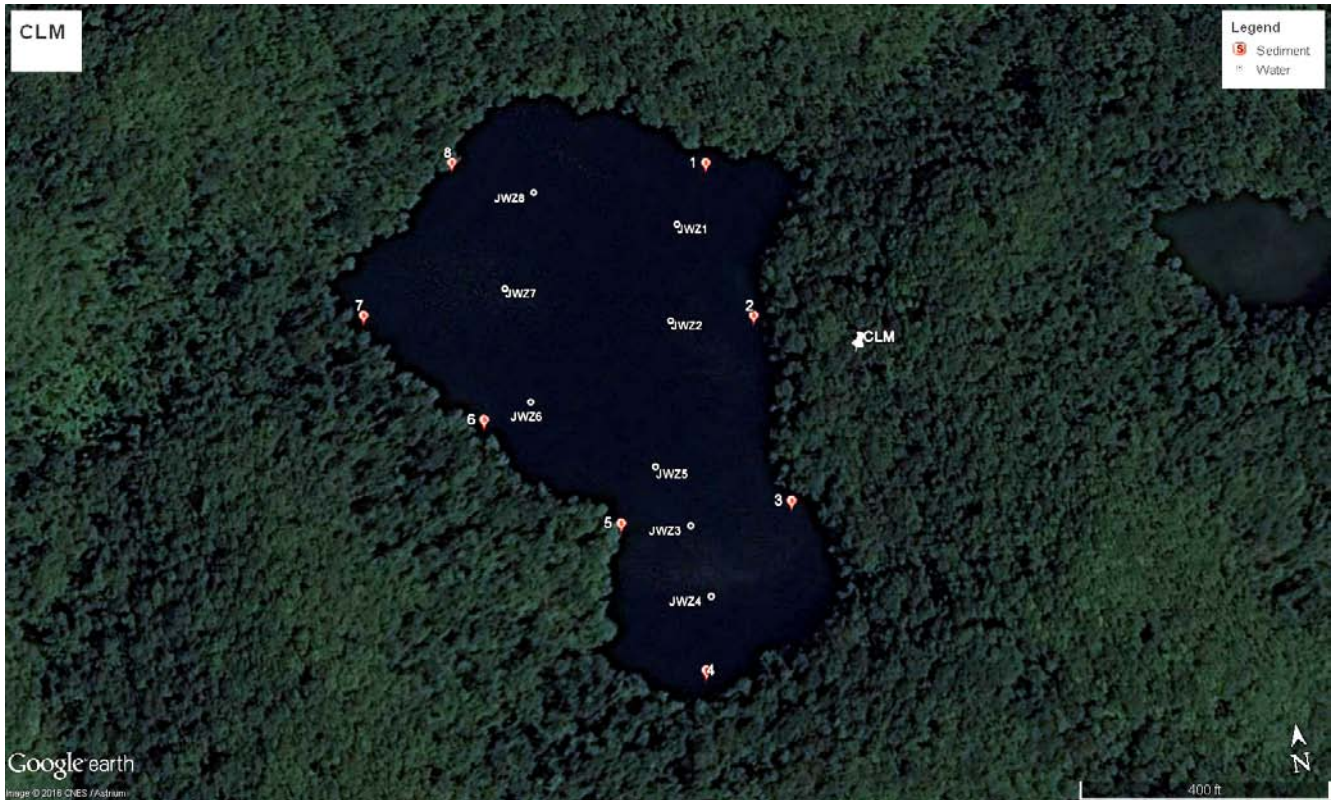
Figure 3d. Sampling sites inside of Clear Lake at the center of Mecherchar Island. W indicates points that water samples were collected; numbers 1-8 around the perimeter of the lake are sediment sampling locations.