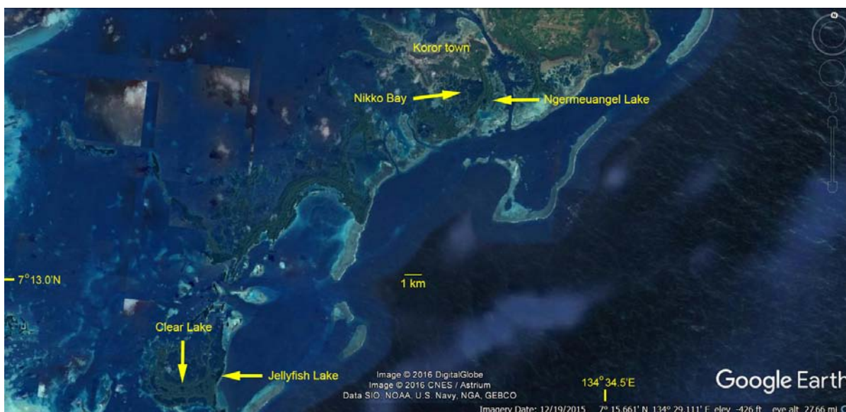
Figure 1. Map of main localities mentioned in the text, including sample locations detailed in Table 1. Jellyfish Lake (Ongeim'l Tketau; OTM); Clear Lake (CLM); Ngermeuangel Lake (NLK).